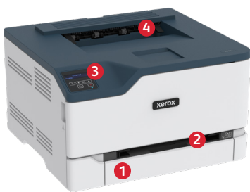
Xerox® C230 Color Printer