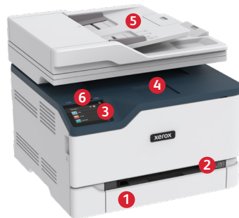
Xerox® C235 Color Multifunction Printer