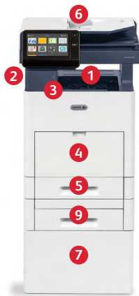
Xerox® VersaLink® B605 Multifunction Printer Print. Copy. Scan. Fax. Email.