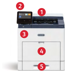
Xerox® VersaLink® B600 Printer Print.