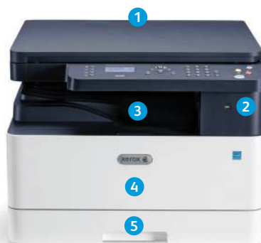
Xerox® B1022 Multifunction Printer

9 The Xerox® B1025 features a larger 4.3-inch colour touchscreen interface for added simplicity.