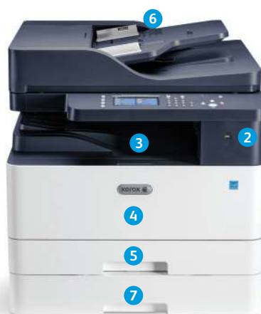
Xerox® B1025 Multifunction Printer

DADF configuration shown with optional additional tray.