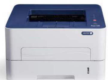
Phaser 3260. Print.