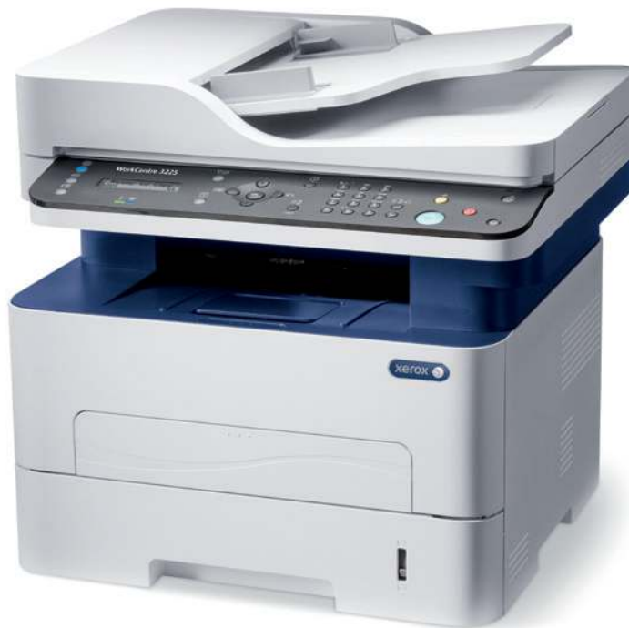
WorkCentre 3225. Copy. Print. Scan. Fax. Email.