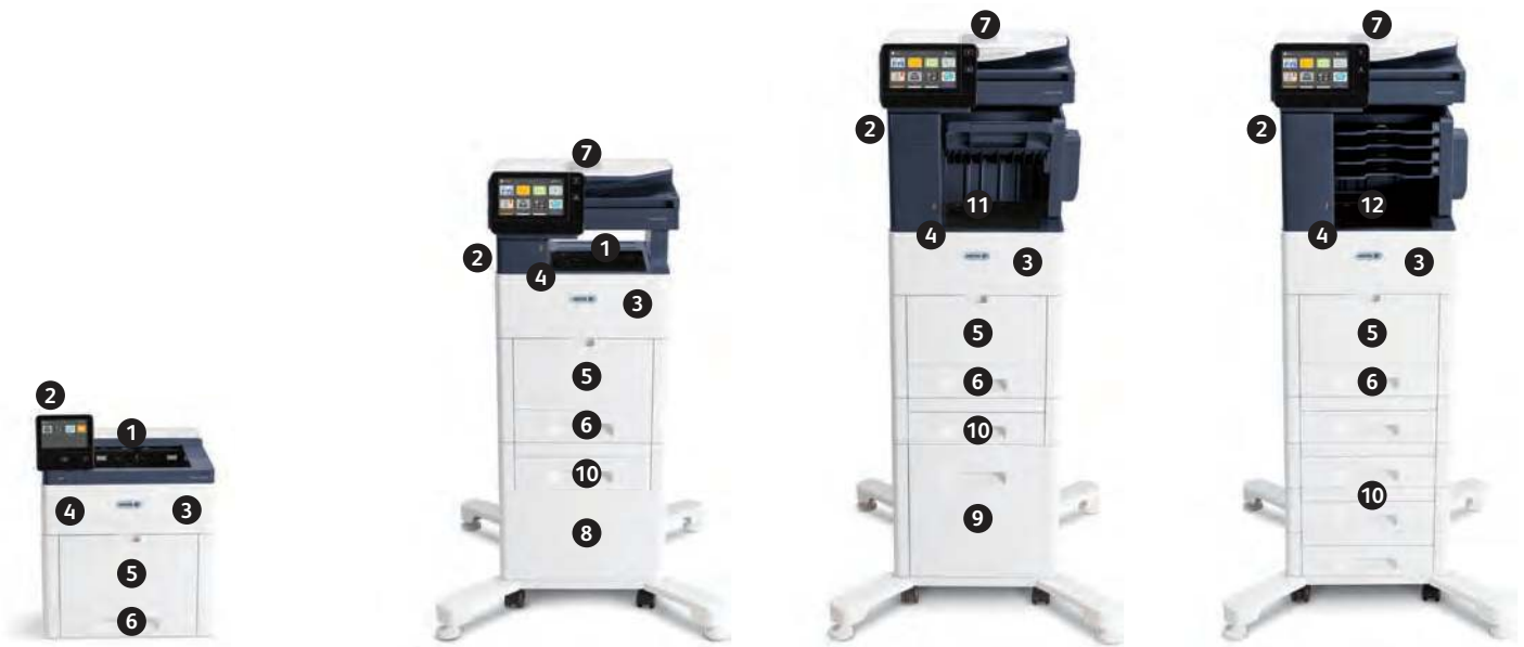
Xerox® VersaLink® C600 Colour Printer Print. Mobile connectivity. Xerox® VersaLink® C605 Colour Multifunction Printer Print. Copy. Scan. Fax. Email. Mobile connectivity.

1 500-sheet output tray with tray-full sensor (400-sheet capacity on C605X).