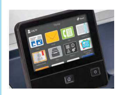
Xerox® VersaLink® B400 Printer Print.

This unmatched balance of hardware technology and software capability helps everyone who interacts with the VersaLink B400 Printer or VersaLink B405 Multifunction Printer get more work done, faster.