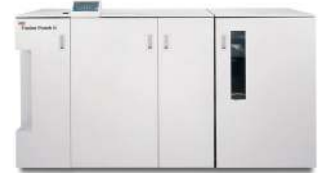
GBC® FusionPunch® II with Offset Stacker