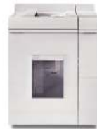
Basic Finisher Module