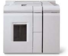
Basic Finisher Module – Direct Connect