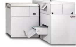
Watkiss PowerSquare™ 224