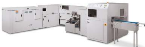
Xerox® Book Factory