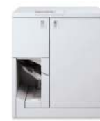
Xerox® Tape Binder