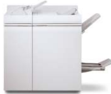
Multifunction Finisher Pro Plus