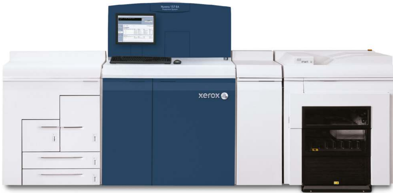
Xerox Nuvera® 157 EA Production System with Xerox® Production Stacker