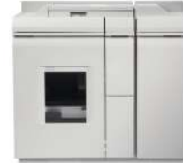
Basic Finisher Module Plus