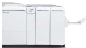
Plockmatic Pro 50/35 Booklet Maker (Available on 120/144/157 only)