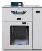
C.P. Bourg BSFx Dual-Mode Sheet Feeder