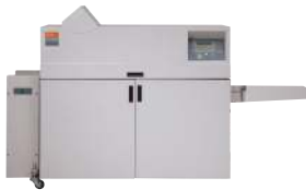
C.P. Bourg BDFNx Booklet Maker