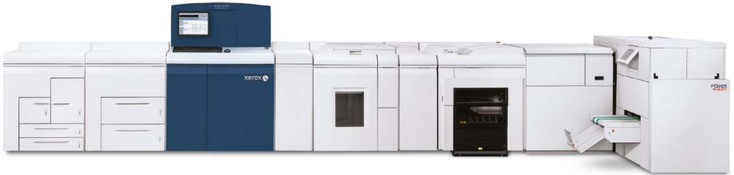
Xerox Nuvera® 157 EA Production System with Xerox® Production Stacker and Watkiss PowerSquare 224